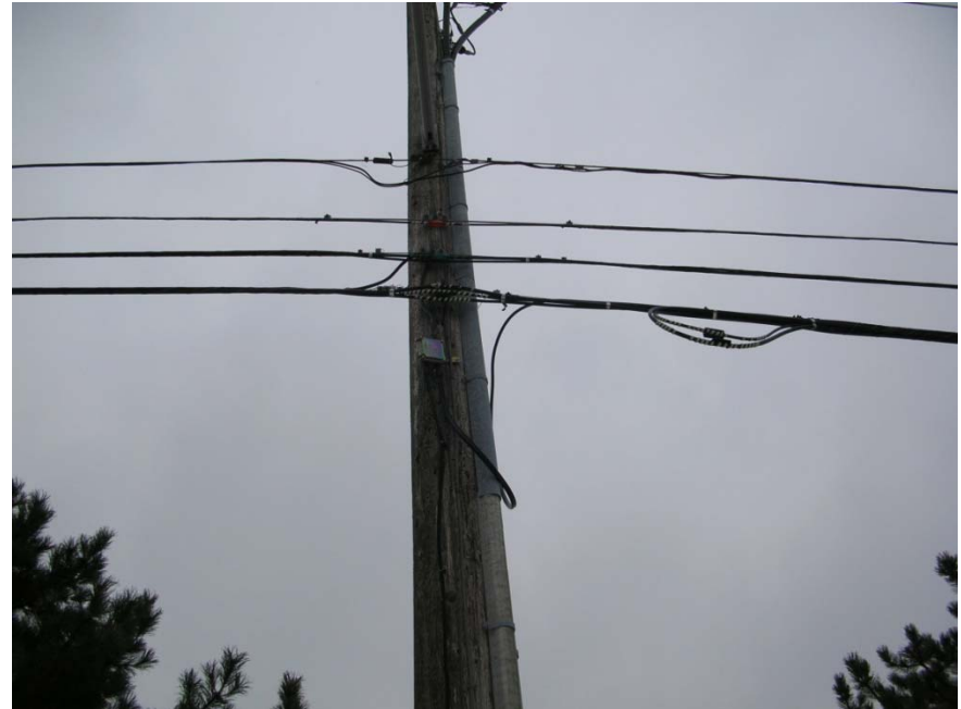
Rogers, Cogeco and Bell attachments