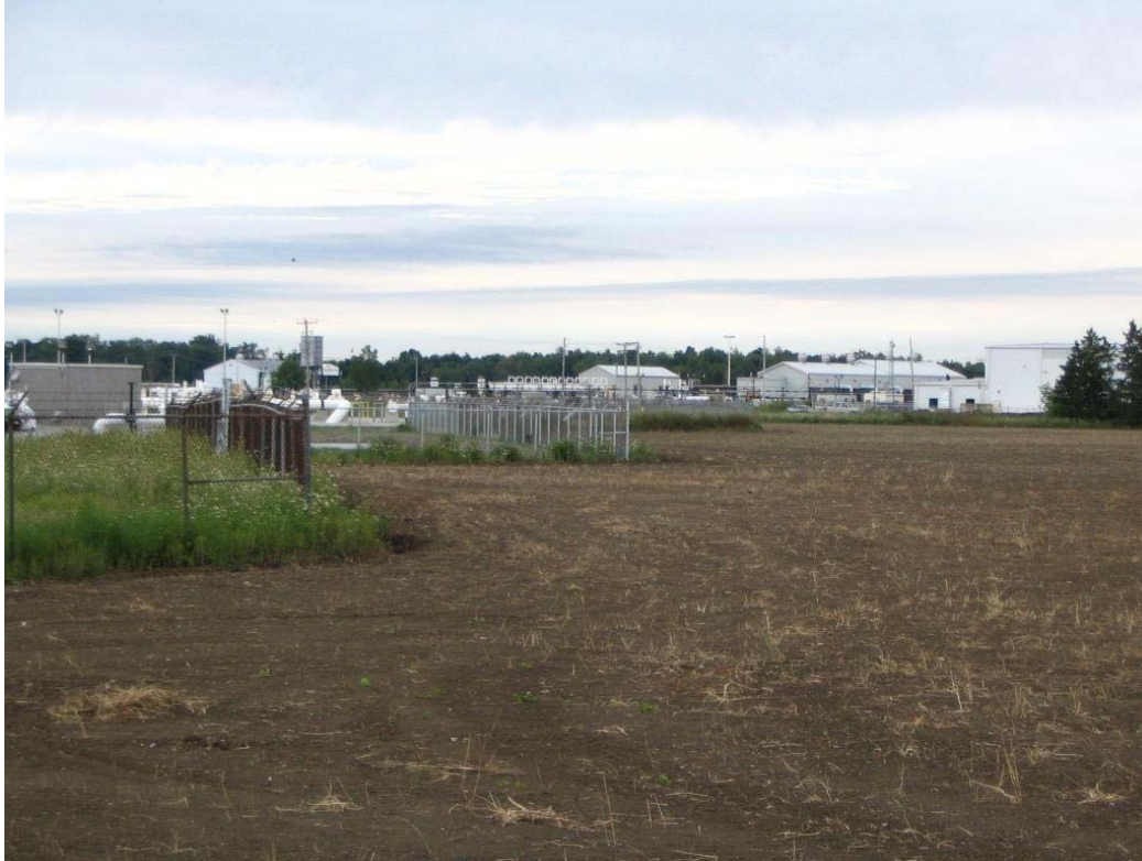
Photo 3: Looking south toward tie-in location at Union Gas Dawn Facility