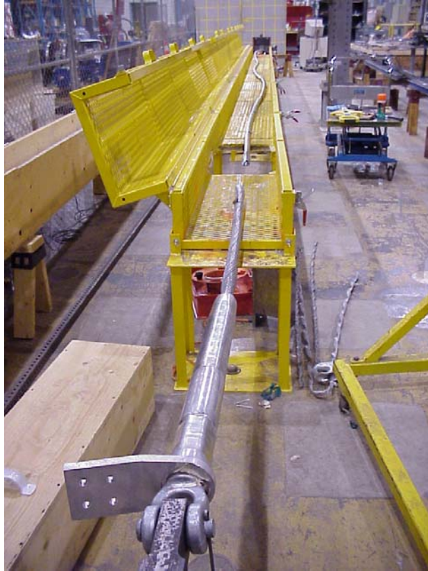
Figure 1a: 1272 kcmil Conductor after Tension to Failure after 168 Hour Sustained Load Test at Room Temperature