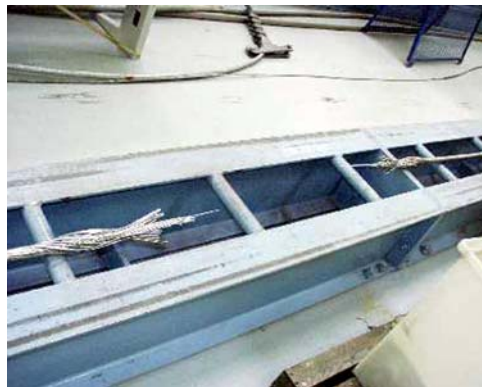
Figure 2 – Failure of Conductor