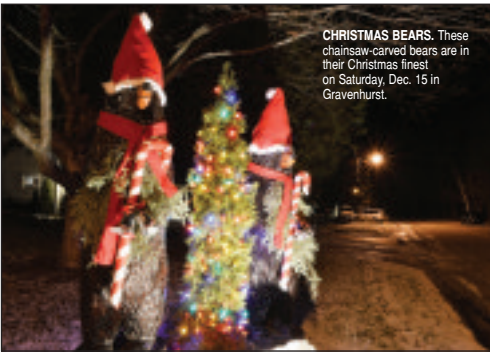
CHRISTMAS BEARS. These chainsaw-carved bears are in their Christmas finest on Saturday, Dec. 15 in Gravenhurst.