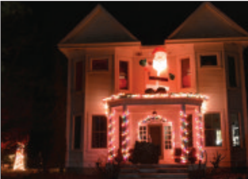
CHRISTMAS MANSION. This big house is decorated with bright lights around the front entrance and a giant waving Santa on the roof.