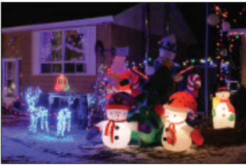
HAPPY HO HO HOUSE. The homes in Gravenhurst are decorated and twinkling with the spirit of Christmas.