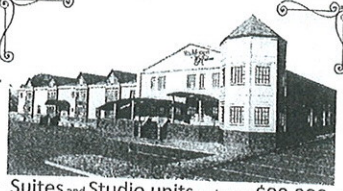
Suites and Studio units as low as $99,900