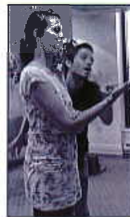
Quelques-uns des participants