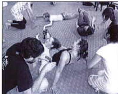
À la plage

Pour plus de renseignements sur Les Improposables, rendez-vous sur la page Facebook Les Improposables ou bien communiquez par courriel à l'adresse ligueimproprotoronto@gmail.com .