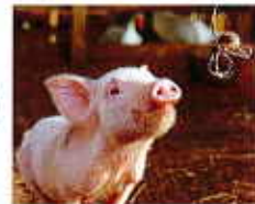
Charlotte's Web will be shown Sept. 27 at the Central Library.

Sept. 25 - Percy Jackson: Sea of Monsters . The son of Poseidon and his friends embark on a quest to the Sea of Monsters to find the mythical Golden Fleece while trying to stop an ancient evil from rising.