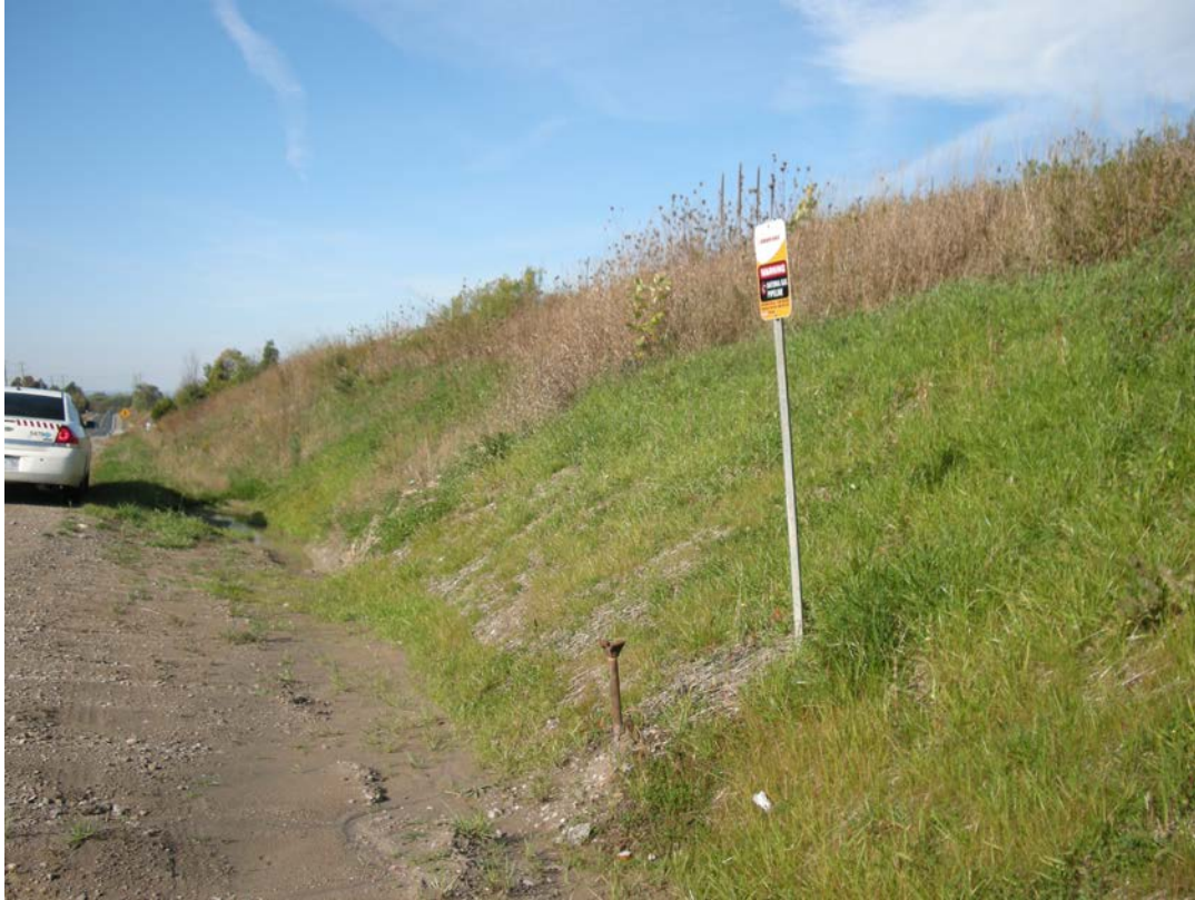
Photo 5: Looking west on north side of County Road 21 in vicinity of 5057 County Road 21