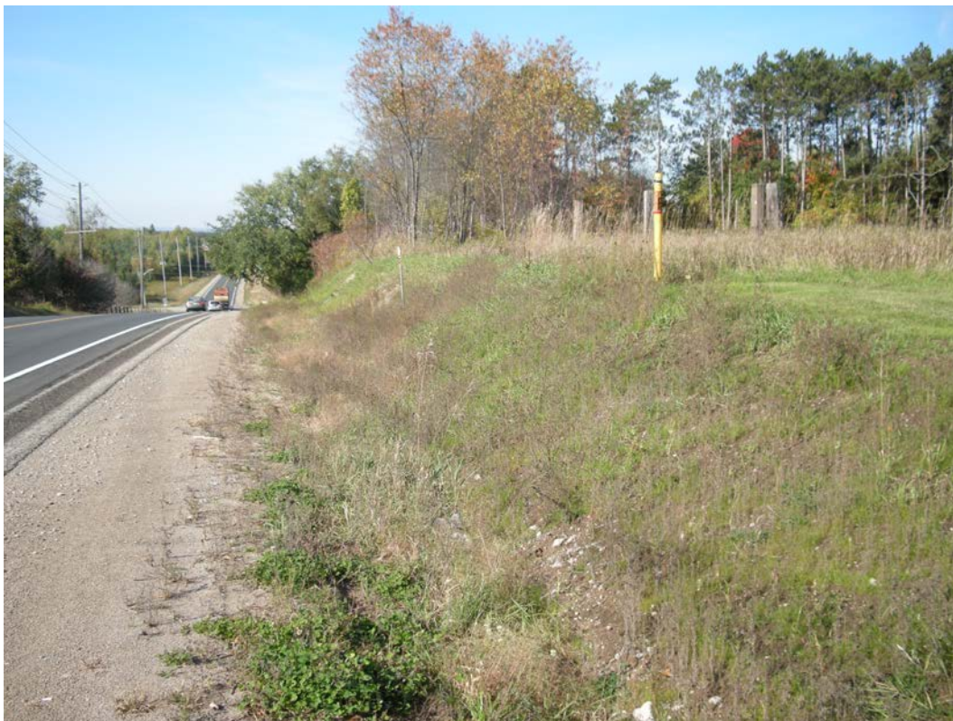
Photo 8: Looking west on north side of County Road 21 in vicinity of 5327 County Road 21