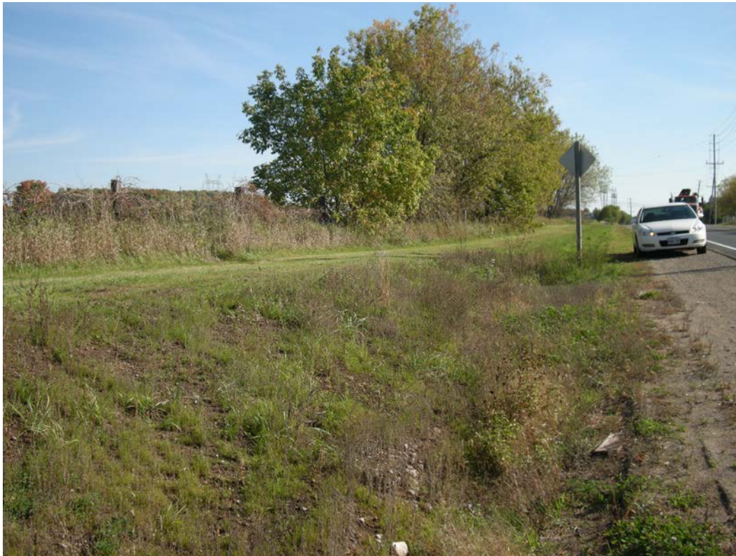
Photo 9: Looking east on north side of County Road 21 in vicinity of 5327 County Road 21