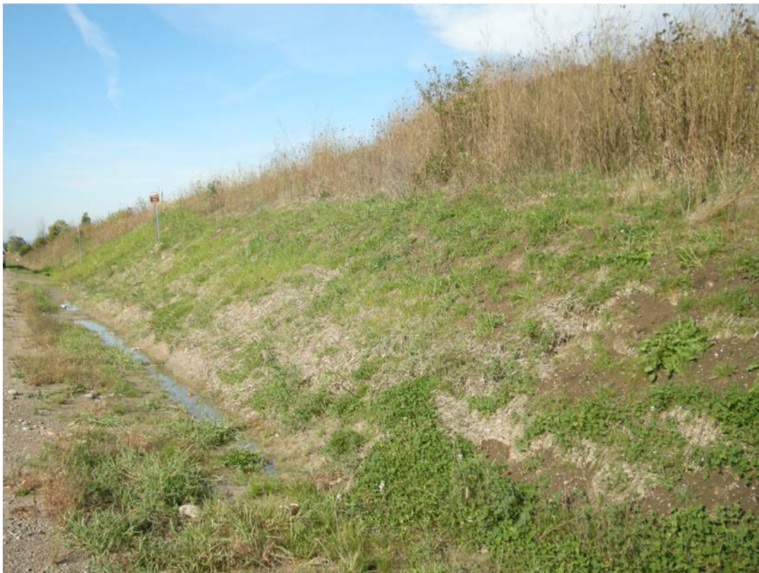
Photo 4: Looking west on north side of County Road 21 in vicinity of 5057 County Road 21