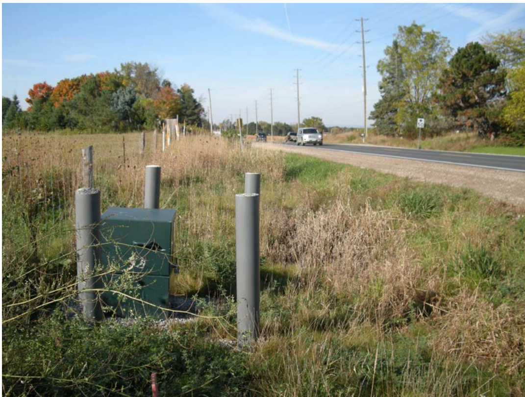
Photo 10: Looking west on south side of Innisfil Beach Road in vicinity of 4118 Innisfil Beach Road