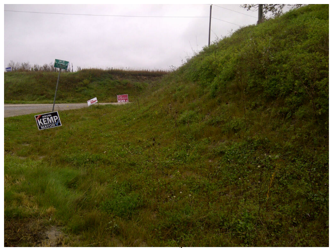
Photo 7: South west corner of Highway 89 and 15<sup>th</sup> Sideroad, looking east