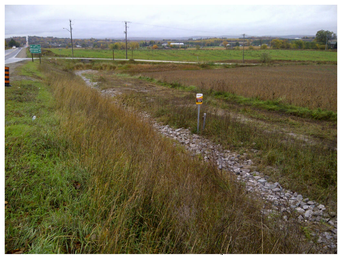
Photo 11: South side of Highway 89, looking east towards 20<sup>th</sup> Sideroad