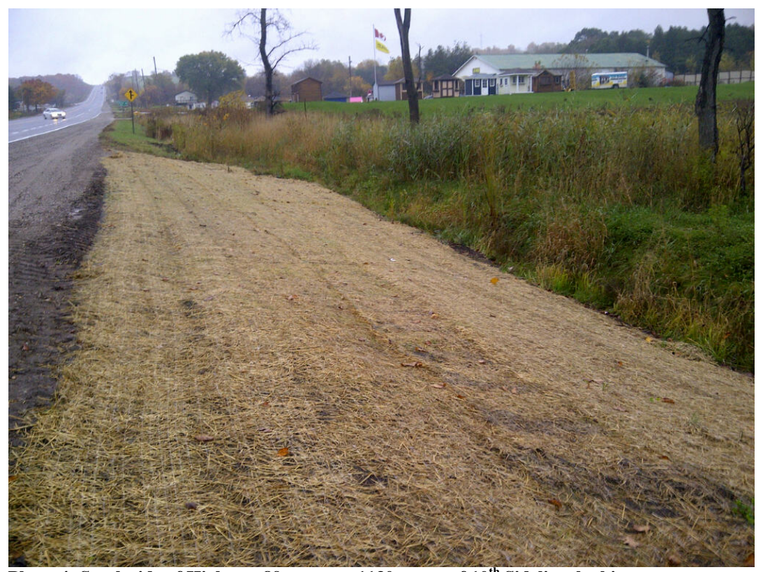
Photo 4: South side of Highway 89, approx. 1130m east of 10<sup>th</sup> Sideline, looking east