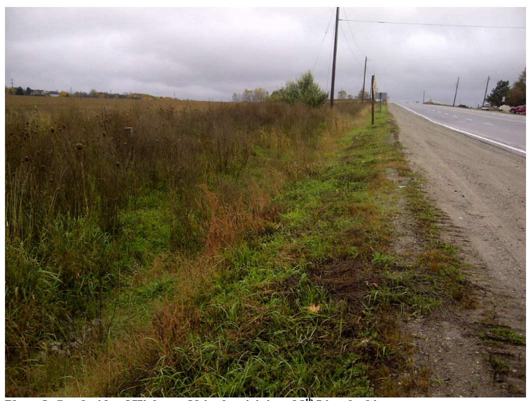
Photo 8: South side of Highway 89 in the vicinity of 8<sup>th</sup> Line, looking west