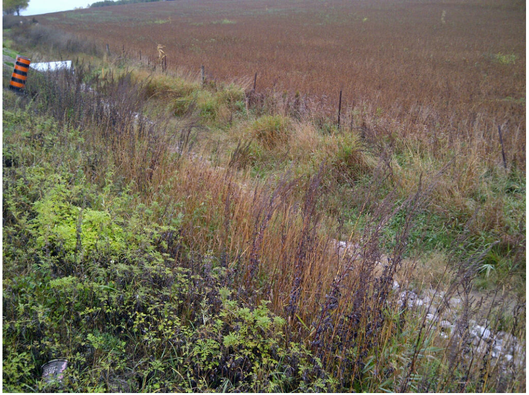
Photo 10: South side of Highway 89 approx. 430m east of 9th Line, looking south-east