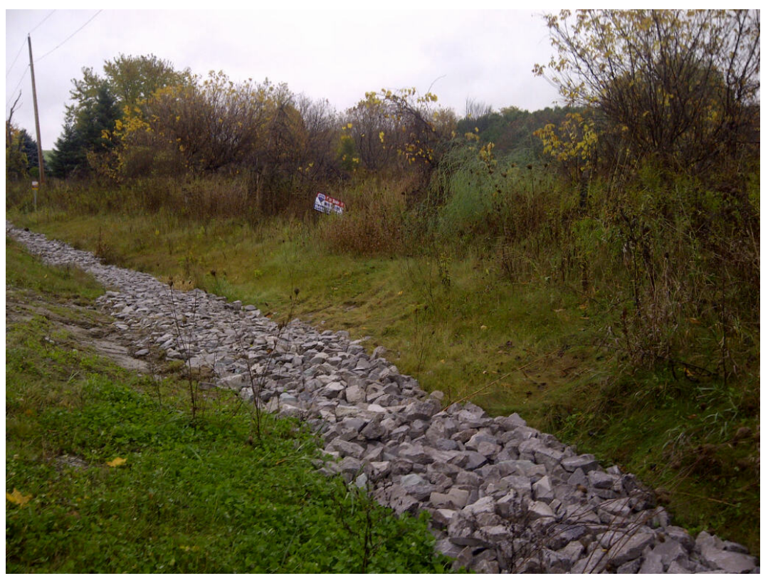
Photo 5: South side of Highway 89, east of Wesson Road, looking east