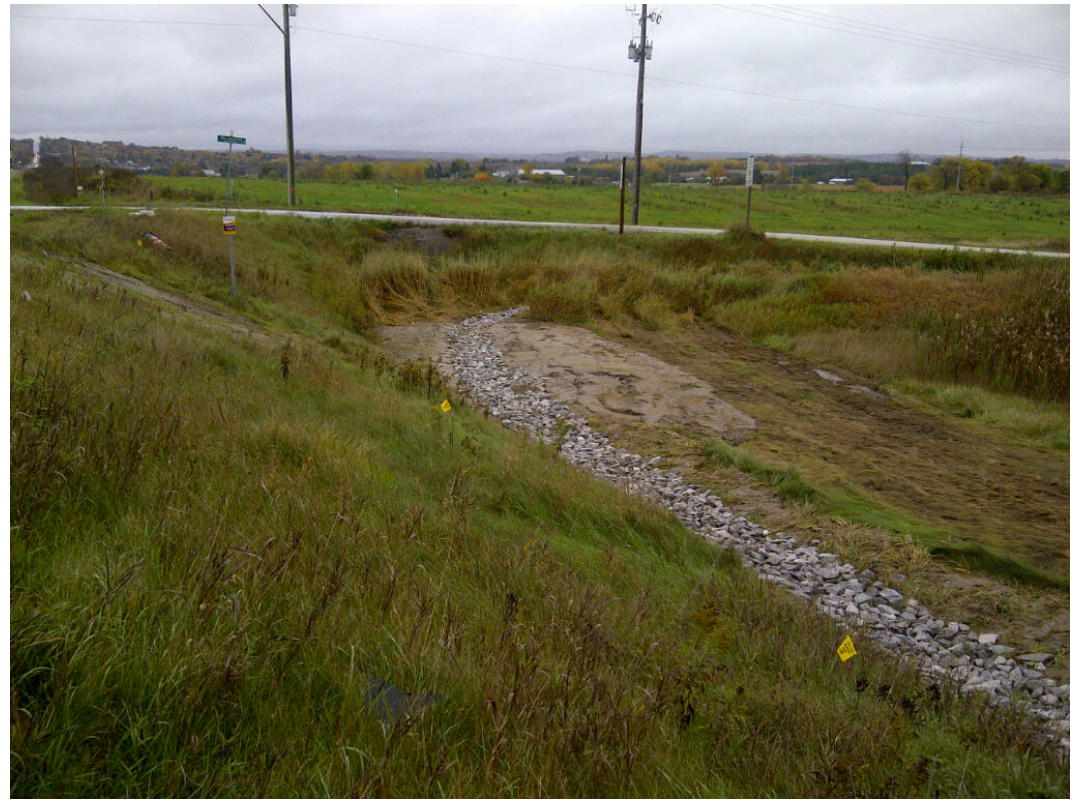
Photo 12: South side of Highway 89, looking east towards 20th Sideroad