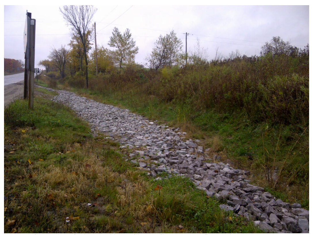
Photo 6: South side of Highway 89 and Simcoe County Road 56, looking east