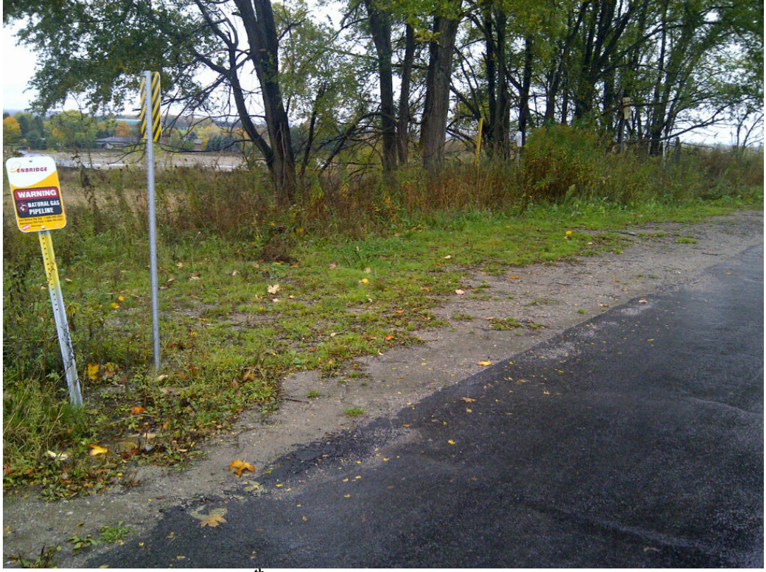
Photo 14: South side of 4174 15<sup>th</sup> Line Road, across from Cookstown Gate Station, looking west