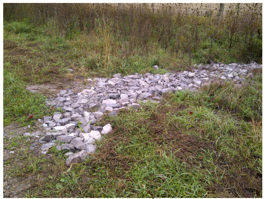
Photo 9: South side of Highway 89 in the vicinity of 9th Line, looking south-east