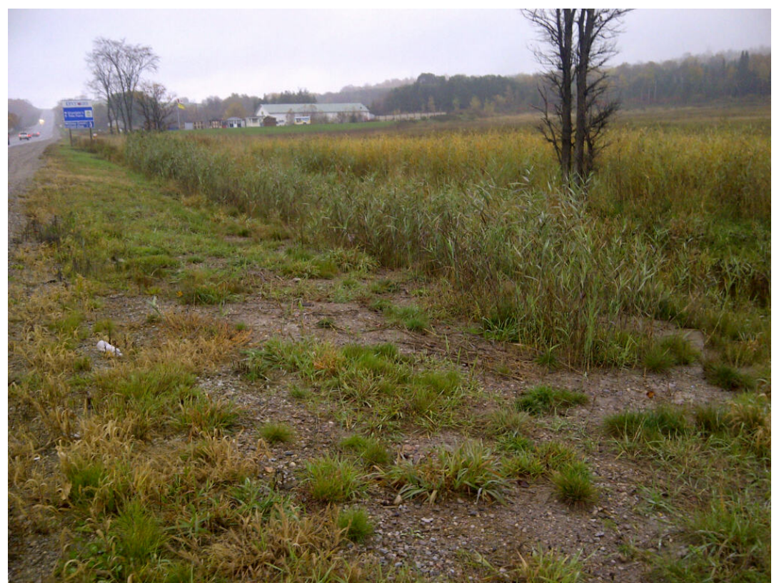
Photo 3: South side of Highway 89, approx. 1030m east of 10<sup>th</sup> Sideline, looking east