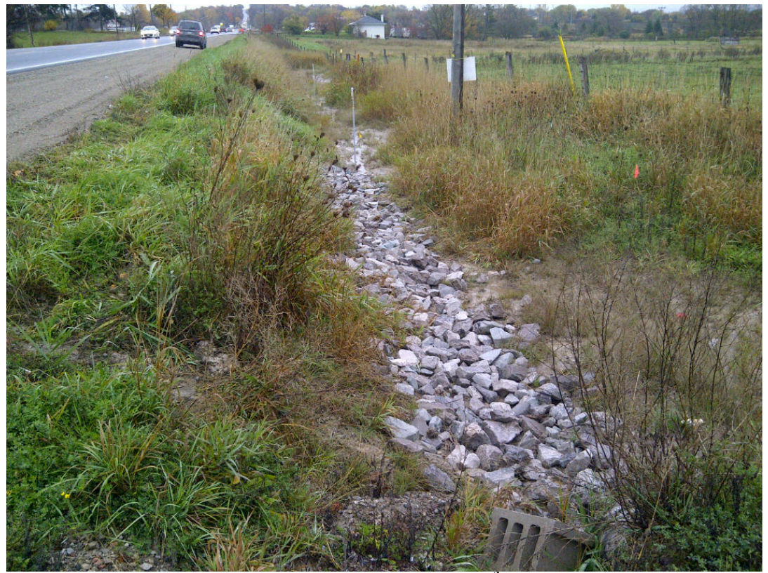
Photo 13: South Side of Highway 89 approx. 350m west of 11<sup>th</sup> Line