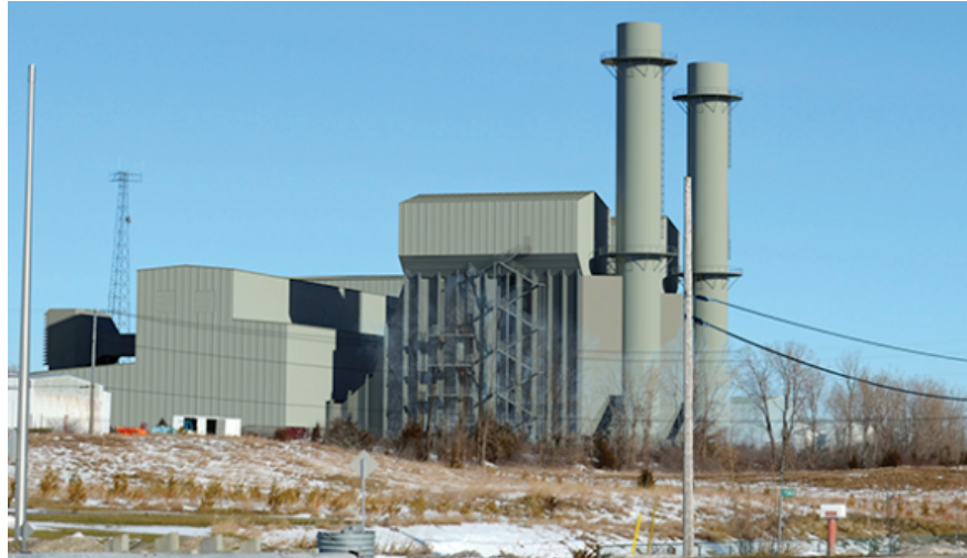
Acoustic Assessment for the Napanee Generating Station

an appropriate technical model to project the impact of sound travelling over water. As any Canadian in a canoe can attest, sound seems focused as it travels over water.