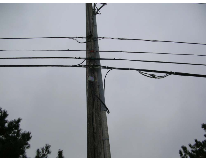
Rogers, Cogeco and Bell attachments