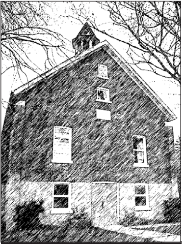
NEWS FROM LONDESBORO

On Tuesday, May 12, Grades 4 though 8 held their in-school track and field day. Winners from that day will proceed to the regional event on May 20 at Goderich High School.