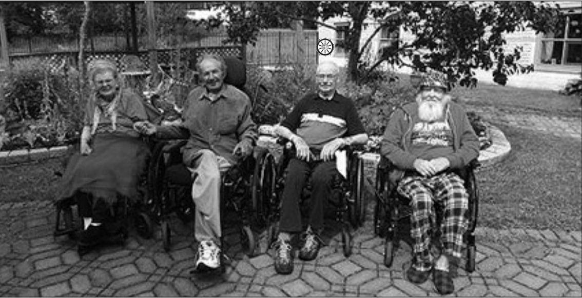
Glena Clearwater - Photo