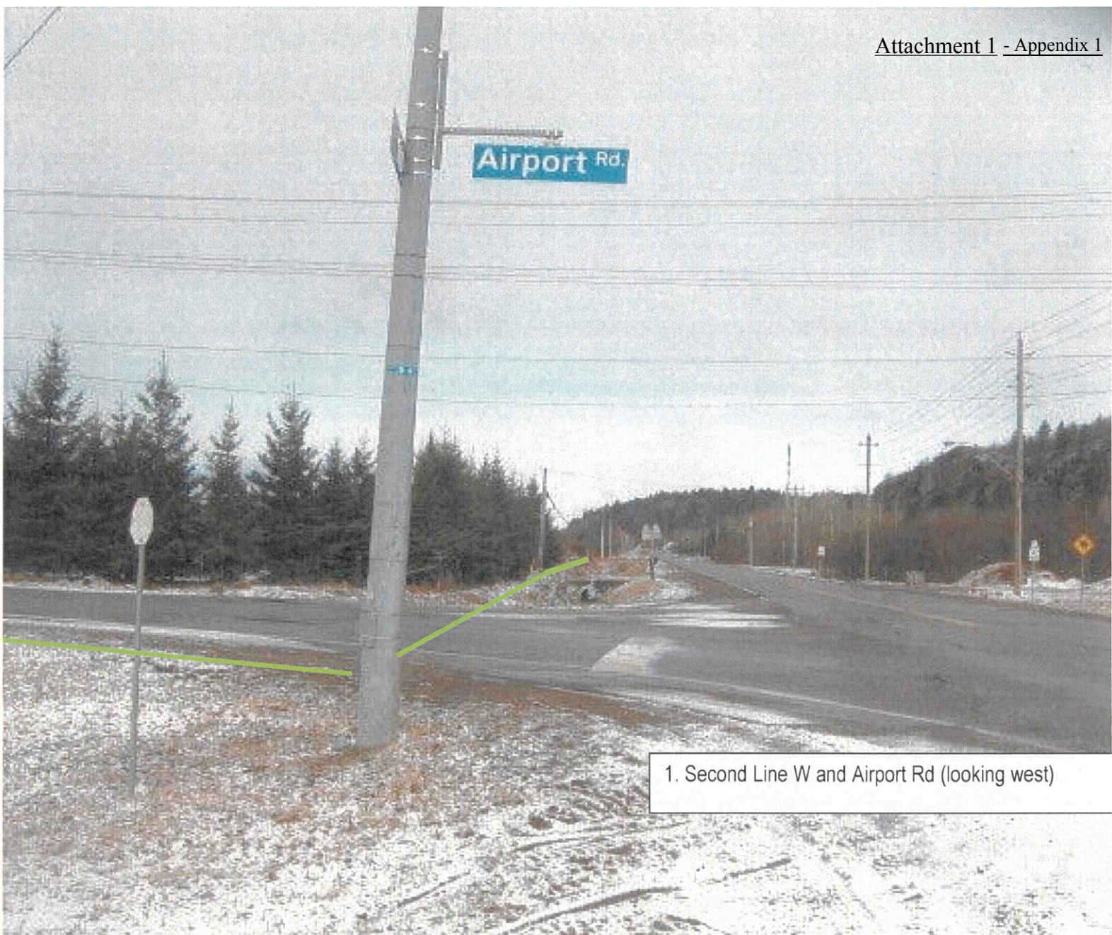
1. Second Line W and Airport Rd (looking west)