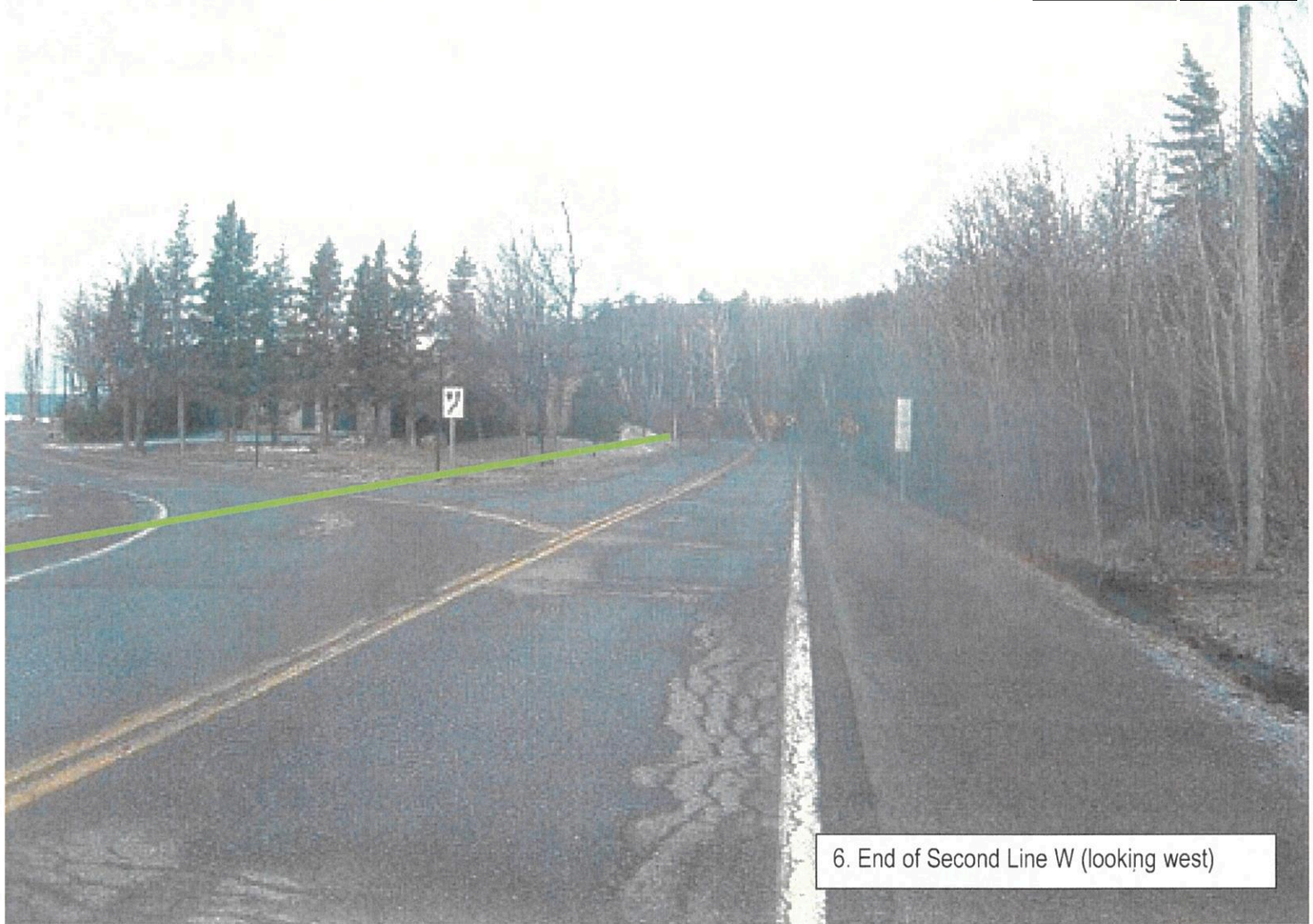
6. End of Second Line W (looking west)