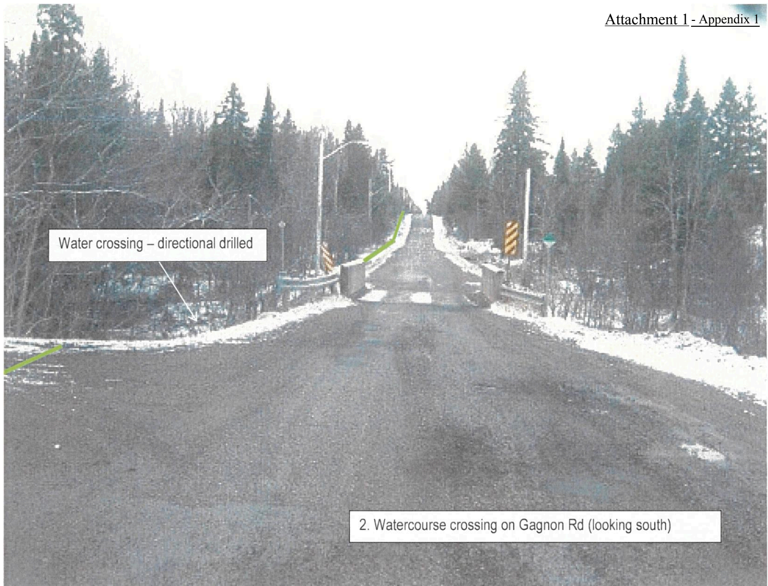
2. Watercourse crossing on Gagnon Rd (looking south)