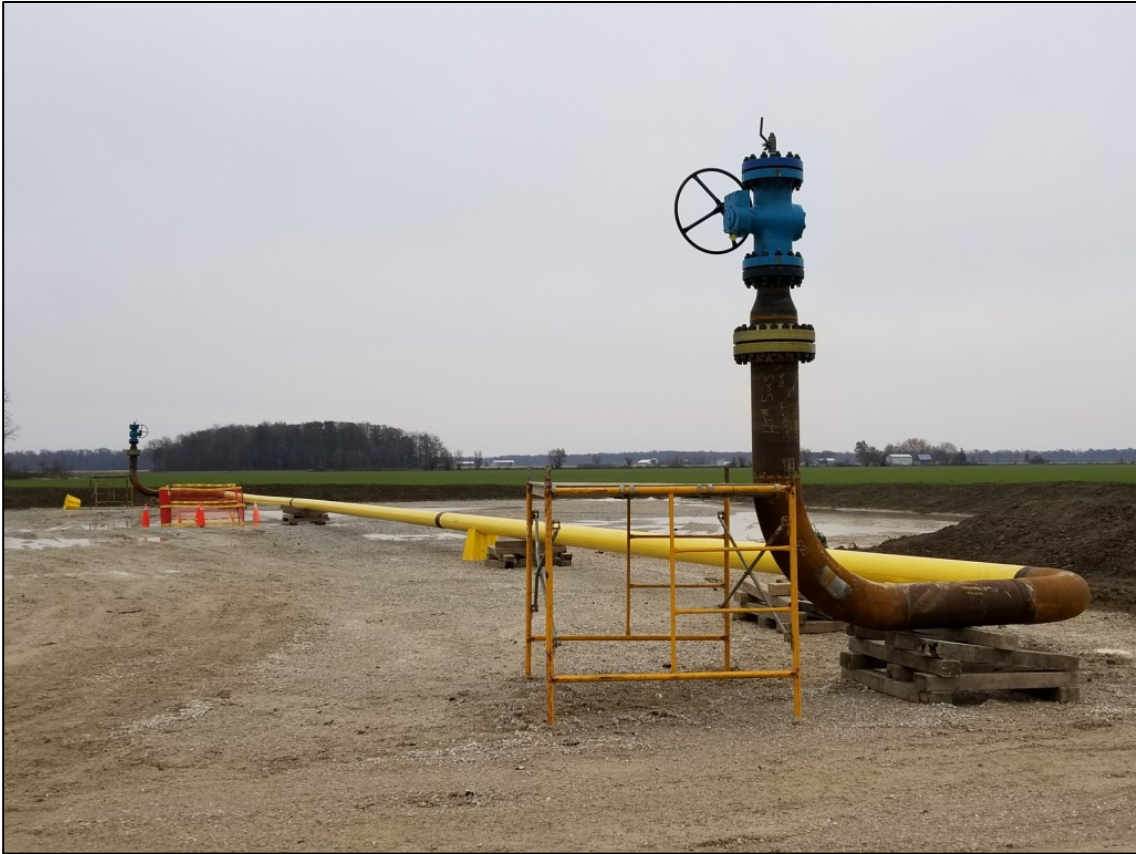
5. The new pipeline was welded and strung out on supports prior to being lowered in the trench.