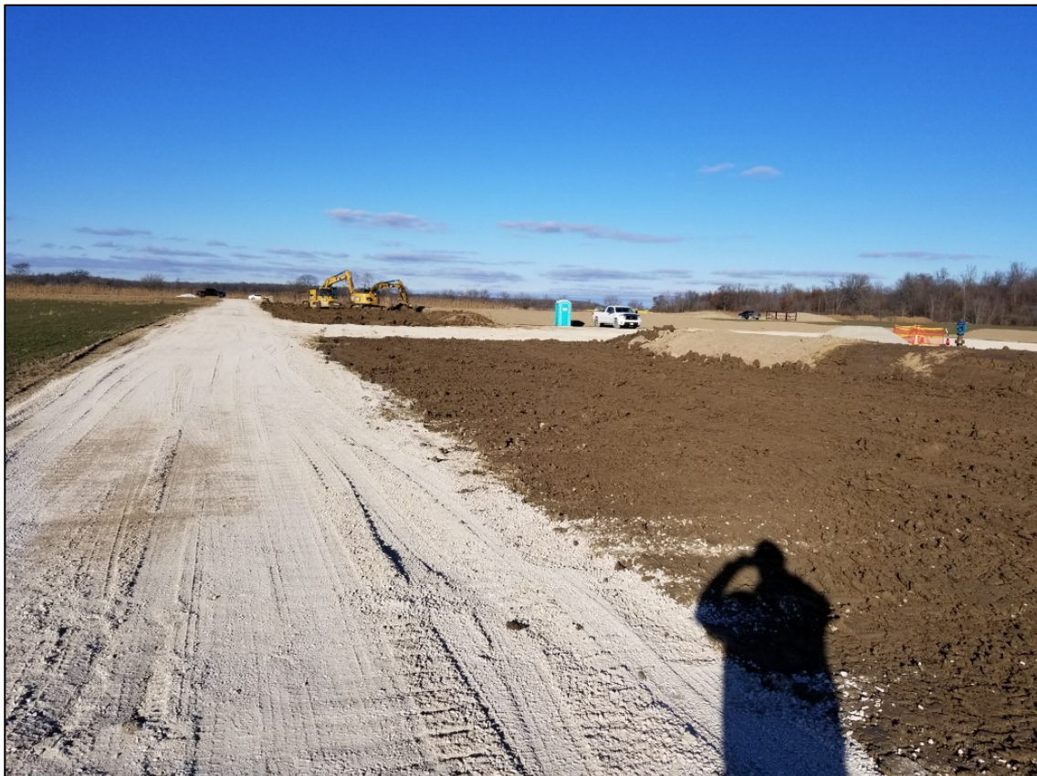
6. Once the pipeline was installed the trench was backfilled and the stockpiled topsoil was spread over the work area.