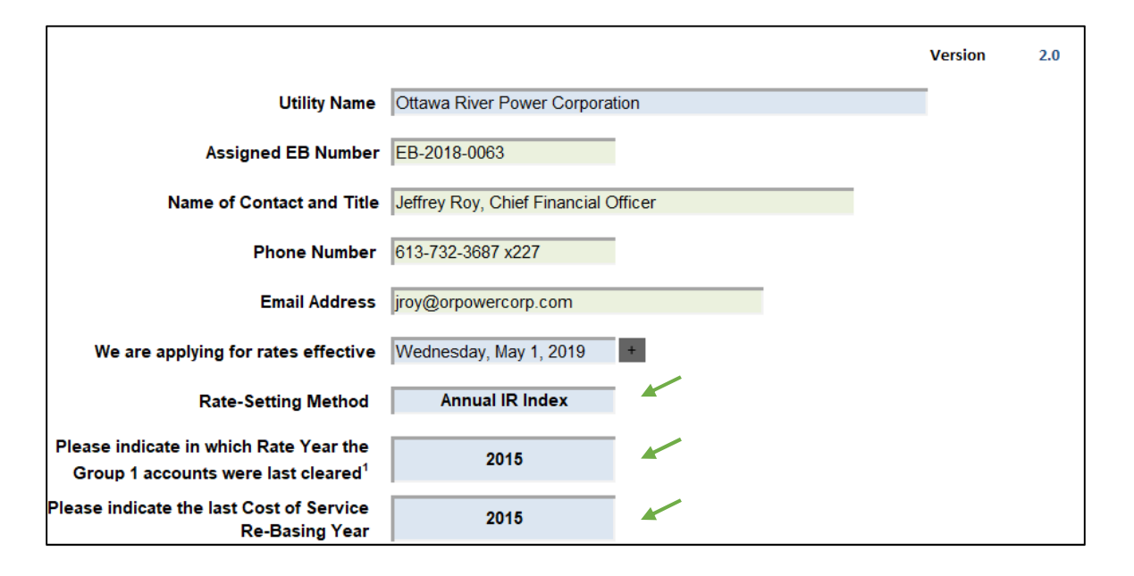
Tab 1 (Information Sheet)

a. For each item below from the IRM rate generator, please confirm accuracy of the following information noted below: