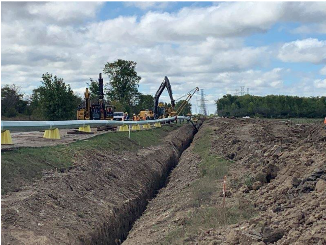
4. Pipeline lowering.