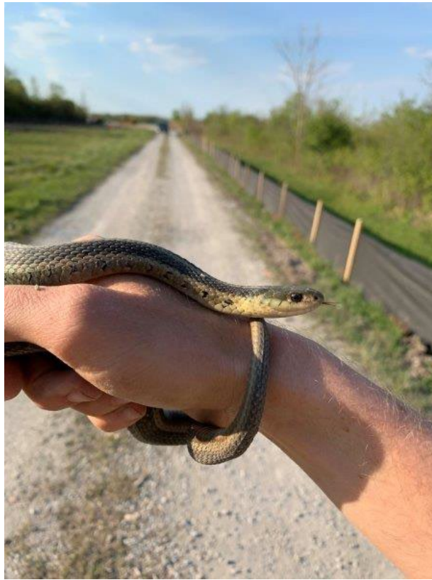
5. Common Gartersnake captured and relocated during the daily snake surveys