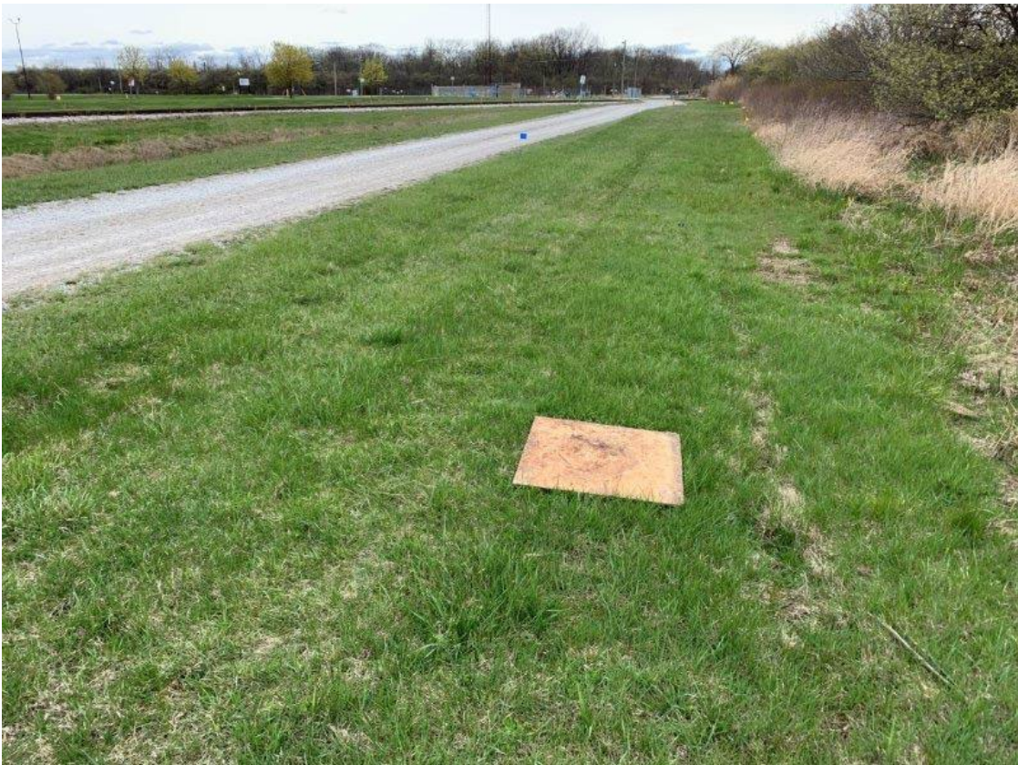
2. Cover board placement during the pre-construction Butler's Gartersnake relocation program.