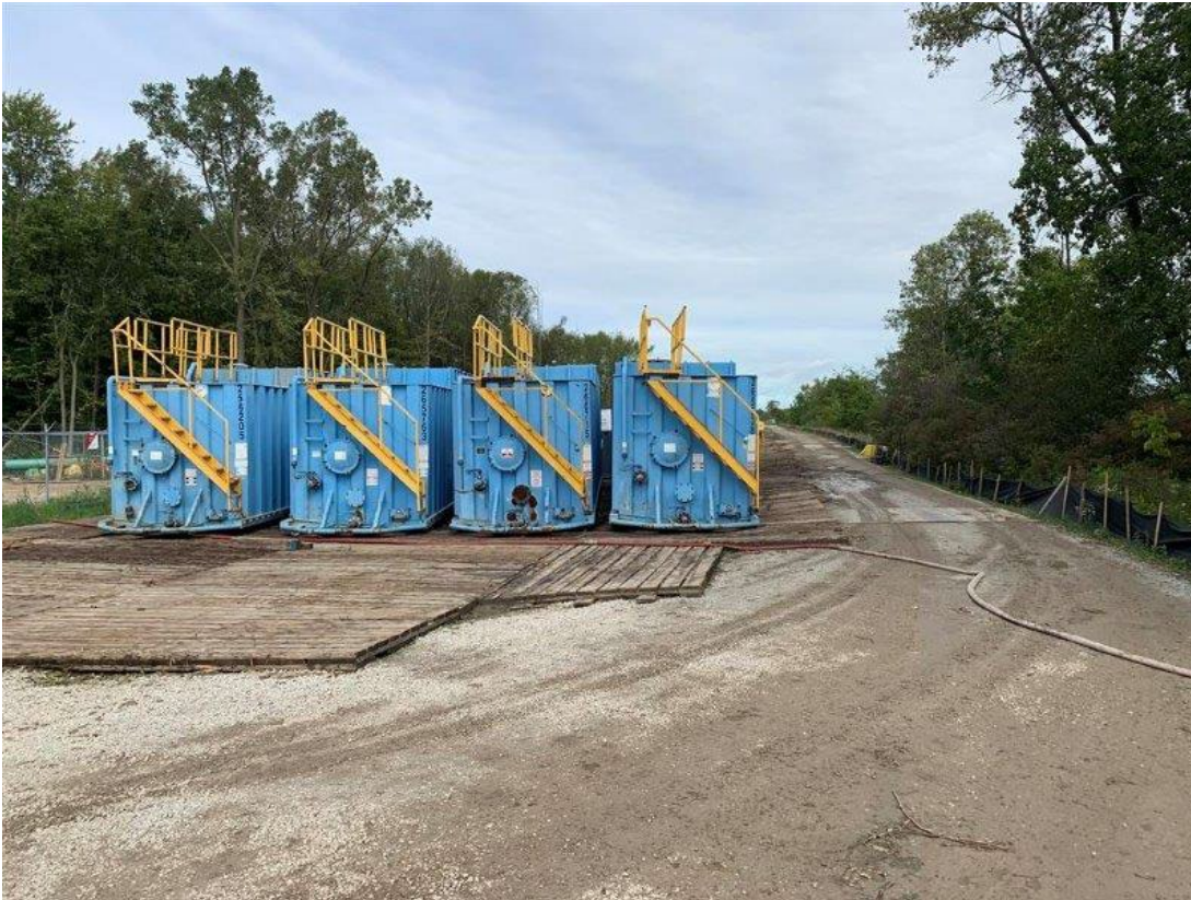
7. Hydrostatic test water storage tanks used to store water post test for testing and disposal.