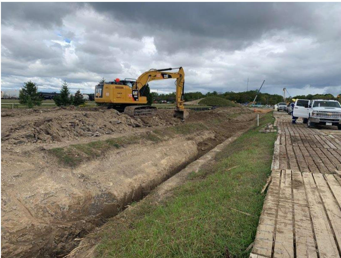
6. Back filling.