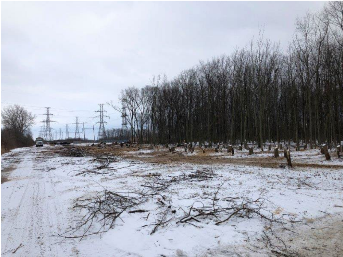
3. Tree clearing program completed prior to breeding bird season and snake emergence.