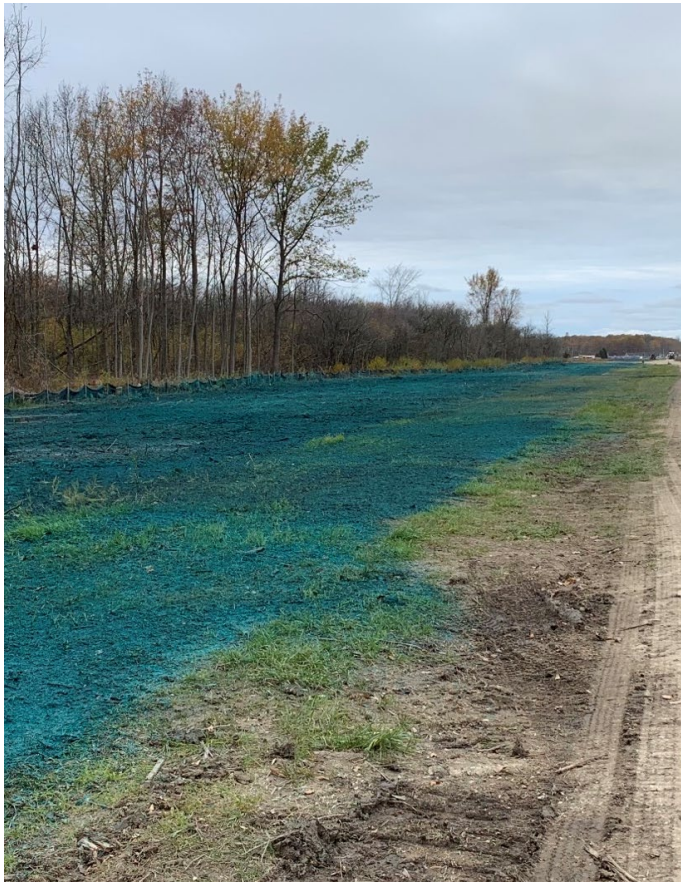
9. Hydroseeding of disturbed work areas following construction.