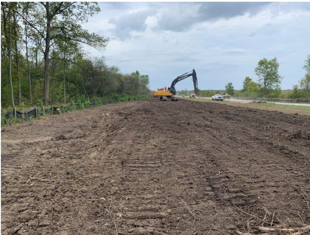
8. Topsoil replacement and final grading.