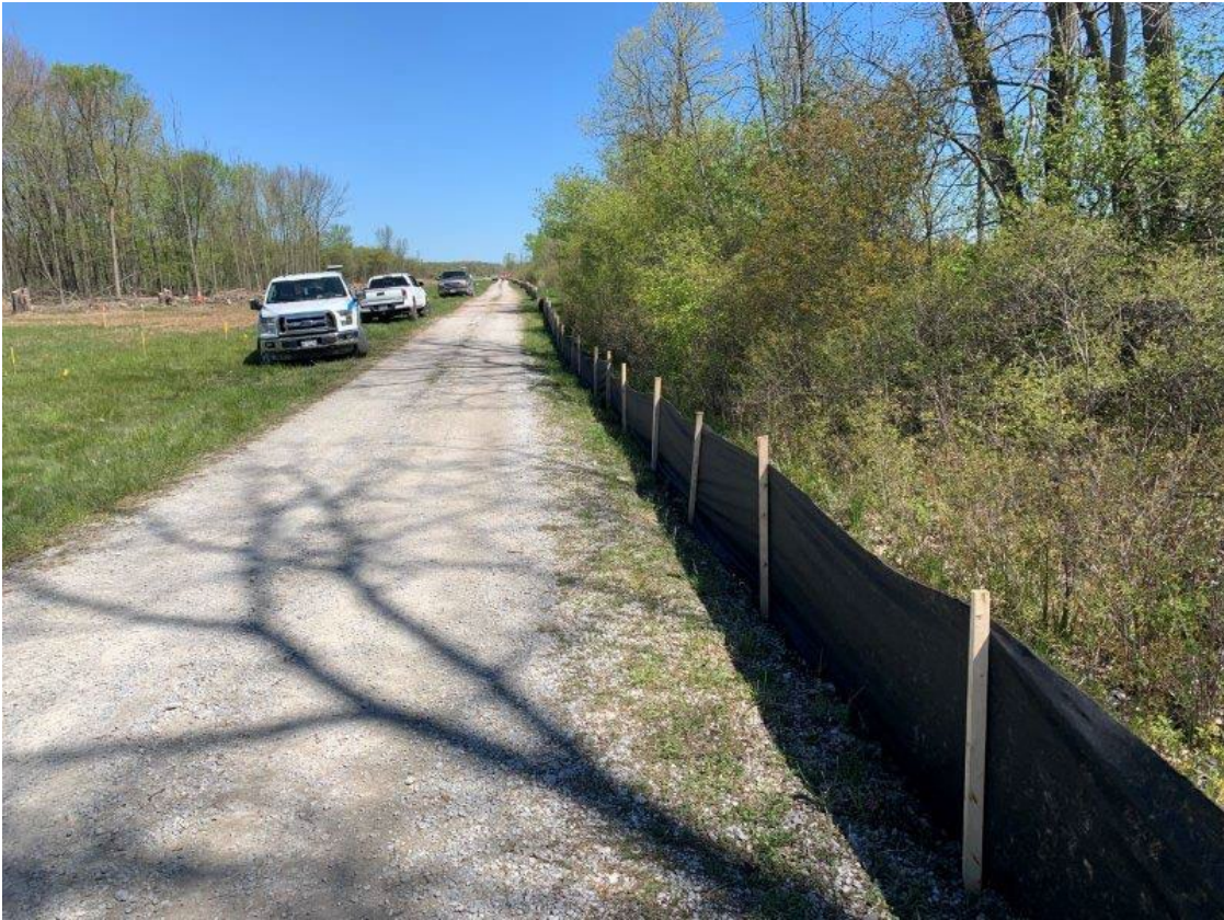
1. Snake exclusion fence installed around the perimeter of the project area