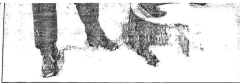
LATEST CREATION. Merle Fletcher of Gravenhurst stands beside the carving of a bear she started in August. With the snow covering a portion of the bear, it appears to be half black bear and half polar bear. Fletcher's interest in carving also includes bird carving at the Gravenhurst Seniors Centre woodworking shop.