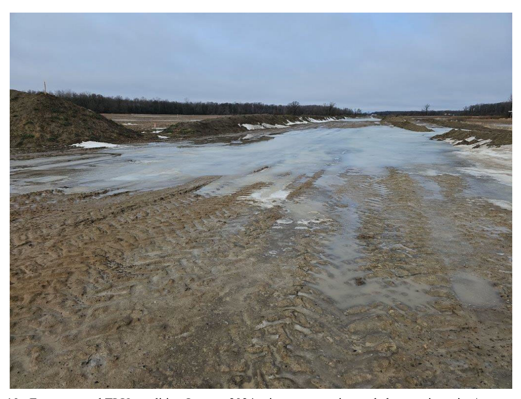
10. Easement and TLU condition January 2024 prior to restoration and clean-up in spring/summer 2024.