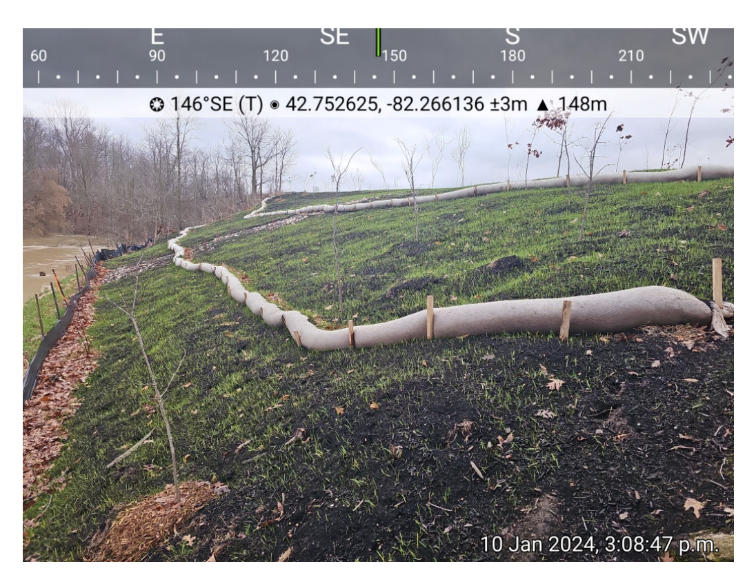
9. Seed germination on the south bank of the Black Creek restoration prior to winter.