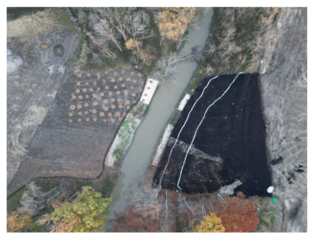
8. Aerial view of Black Creek restoration.

7. Pipe installation at Black Creek using the isolated Dam and Pump Crossing method.