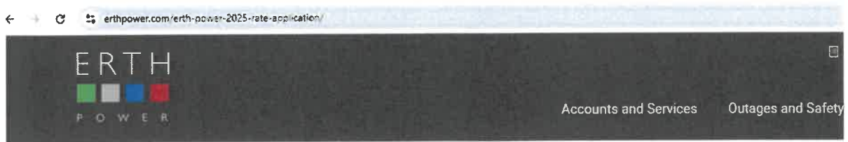
Exhibit 2 Form of Notice -Website